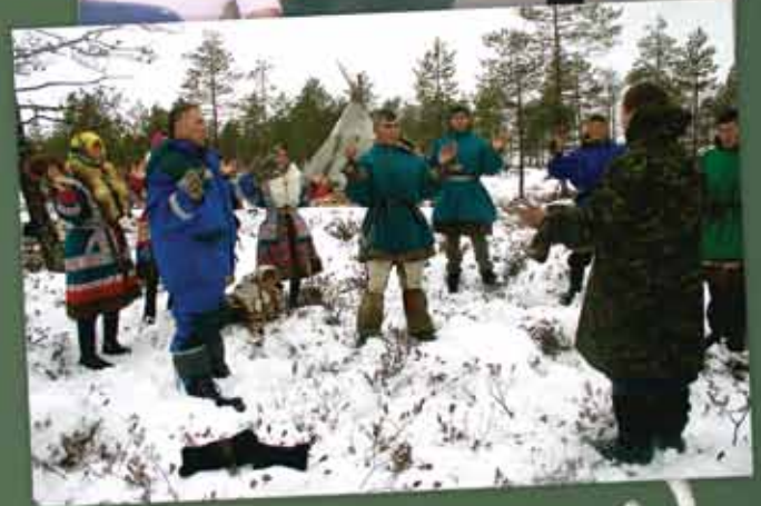
Christians in Khanty-Mantsi, Russia, praise the Lord outdoors.