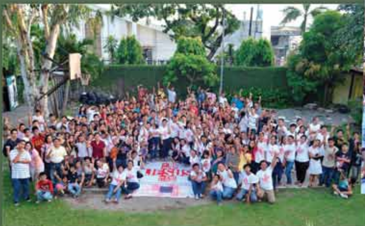
Student Missionary Outreach workers and students celebrate their 35th anniversary.