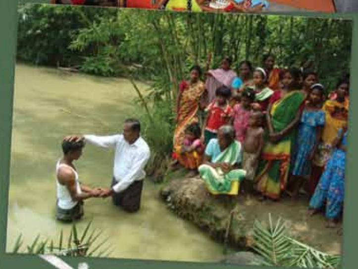
A missionary with Indigenous Mission of Bangladesh baptizes a new believer.