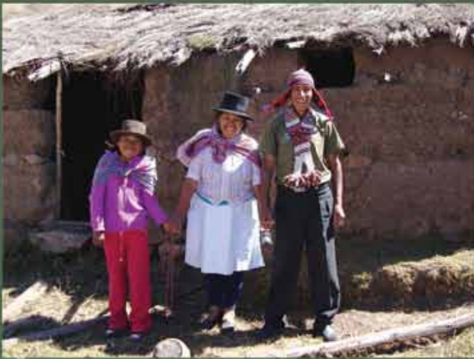
Peruvian missionaries outside of their mountain home.