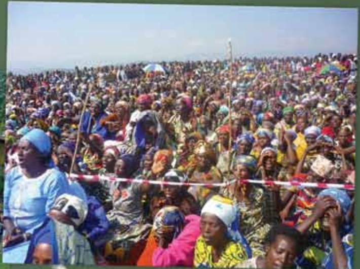
Hundreds gather at an outdoor worship service led by Healing Rwanda Ministries.