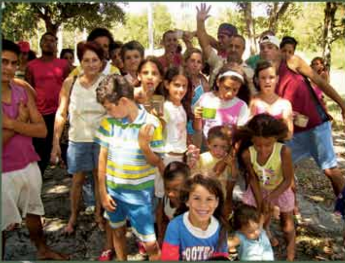
Cuban children in the care of Churches of the Open Bible missionaries enjoy a snack.