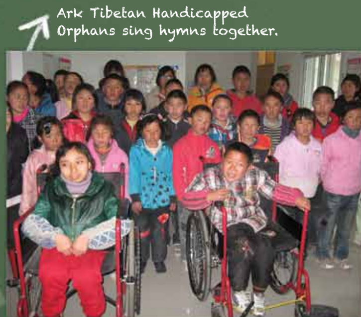
Ark Tibetan Handicapped Orphans sing hymns together.